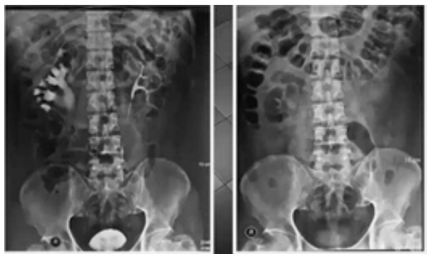
Figure 6. Postoperative KUB-IVU shows no residual contrast on the right kidney.

At the end of the procedure, a 5-mm closed suction drain was positioned close to the anastomosis and a 16F urethral catheter was left indwelling. The urethral catheter was removed the next day. Overall, operative time was 180 minutes and blood loss was about 50 cc. Drain was removed at post-operative day 4. Operating wound was good, maximum VAS score was 3. Patient was discharged at post-operative day 4. After 3 month postoperative, we performed KUB-IVU with no residual contrast were found in the right kidney.