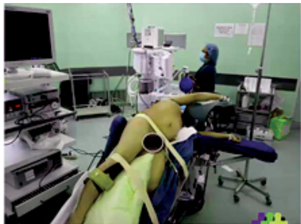
Figure 2. Patient position.

No bowel preparation was performed. After induction of general anesthesia. The patient is on the flank position with the ipsilateral side rotated up approximately 20- degrees. We placed an axillary role and padded pressure points, on the other hand, the table is flexed slightly at the hips. The patient is secured to the table using wide cloth tape at the lower extremities, hips and shoulders. This allows for the patient to be rotated from a relatively horizontal position to the flank position by simply rotating the table. The abdomen and flank is prepped in the usual sterile fashion.