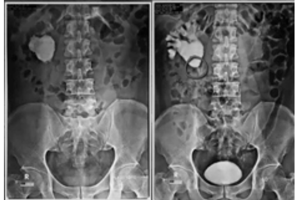
Figure 1. KUB-IVU shows right pyelum calculi and UPJO.

ultrasonography, and diuretic urography (IVU). There is a clinically significant obstruction UPJ and dilatation of the pelvicaliceal system with delayed excretion on the affected side. We then performed laparoscopic pyelolithotomy and Y-V pyeloplasty.