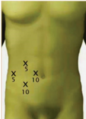
Figure 3. Port position.

We used transperitoneal approach to ease of exposure of the UPJ. First 10-mm trocar was introduced below the umbilicus using a Hasson technique. After achieving the pneumoperitoneum, We use 2 10-mm port and 2 5-mm port.