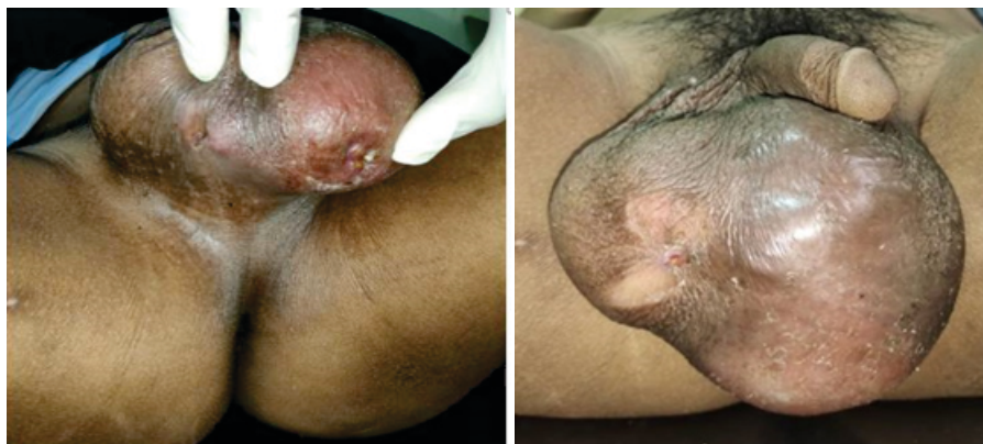
Figure 1. The left scrotum was enlarged, red, and tender on palpation, with fluctuation and skin induration.

Blood test results were as follows: hemoglobin 12.3 g/dl, hematocrit 35.8%, leukocytes 19,910/ul, platelets 390,000/ul, total protein 8.9g/dL, albumin 2.89 g/dL, ureum 26.4 mg/dl, and creatinine 1.28mg/dl. Urinalysis revealed normal specific gravity (1.011) and pH (6.0), but found 46.5 red blood cells/hpf, 7 white blood cells/ hpf, proteinuria (1+), and bacteriuria (1+). Plain chest radiography findings reported increased bronchovascular markings and bilateral infiltrates on lower lobes of the lungs which were suggestive of bilateral pneumonia.