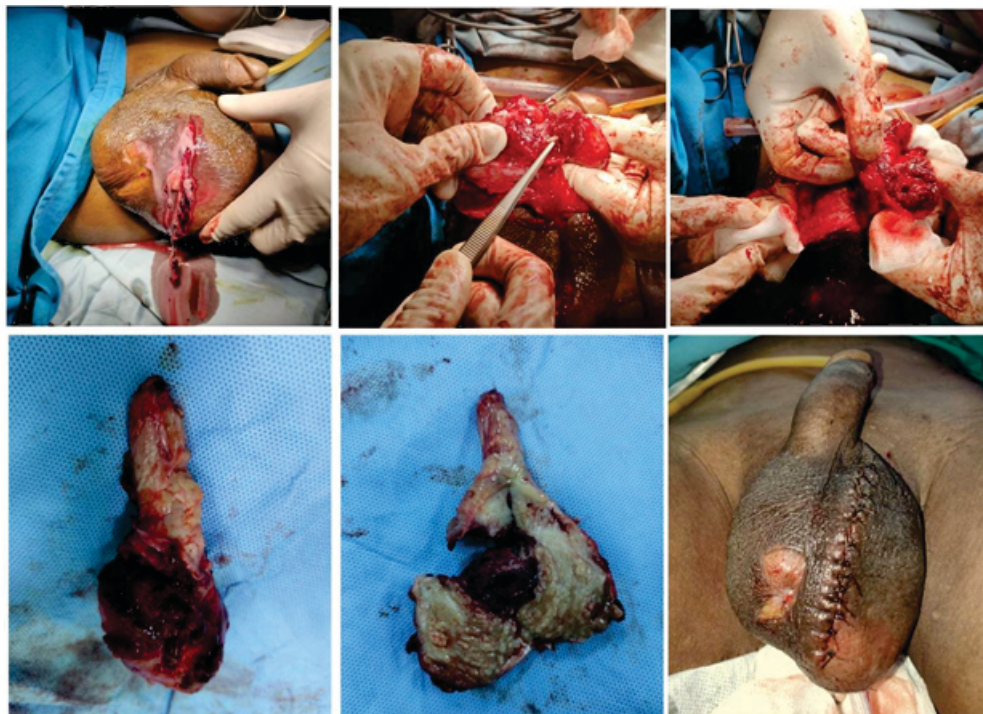
Figure 3. Incisional drainage of abscess and necrotomy debridement of the left scrotal sac was followed by left orchidectomy.