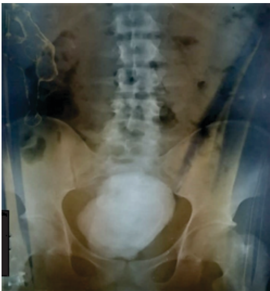
Figure 1. Kidney-ureter-bladder film shows a large opaque mass inside the bladder.

Intravenous antibiotics administered preoperatively. Open cystolithotomy was performed under general anesthesia. The bladder stone, measured 13.2cm x 8cm x 8.3cm in size (Fig. 2) and weighed approximately 940 grams, was extracted without adhesion to the bladder wall. Stone analysis was not performed due to several circumstances. An indwelling urethral catheter was placed for 5 days, showed normal urine flow rate, and perivesical drainage was placed for 2 days. The patient was discharged after 7 days and followed up after 6 months, showed no remaining urinary and defecatory symptoms.