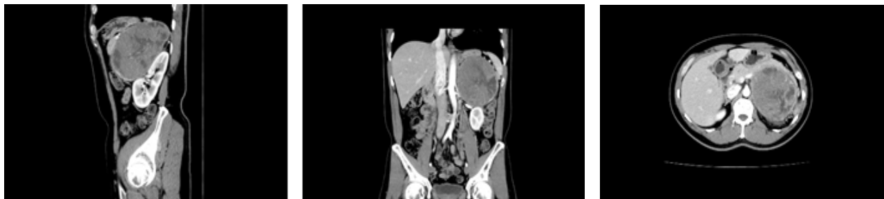
Figure 1. CT Scan appearance of giant adrenal tumor.