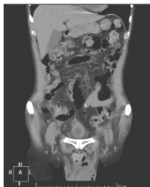
Figure 5. Computerized tomography urogram.

As cancer replicates, tumors may outgrow the blood supply and infiltrate healthy tissues. This causes necrosis within the cancer and/or adjacent