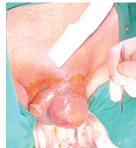
Figure 3. Intraoperative image of initial incision of the scrotum