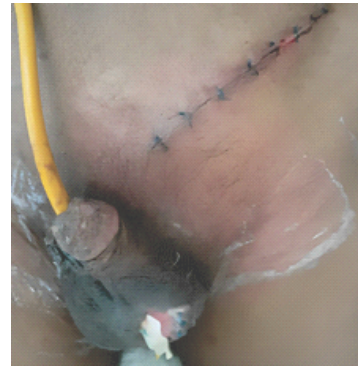
Figure 6. Day-2 after debridement and herniorrhaphy.

cultures, and others are essential. 7 Radiography modalities for diagnosing FG include plain radiography, ultrasonography, CT scan, and MRI. CT has been proven to have greater specificity than plain radiography; the affected area gas can be detected. 6 Supporting examinations in this case that were found to be significant include leukocytosis, and an increase in urea and creatinine. However, radiological studies did not reveal specific images indicating infection in the scrotal fascia or the fascia of the abdominal wall.