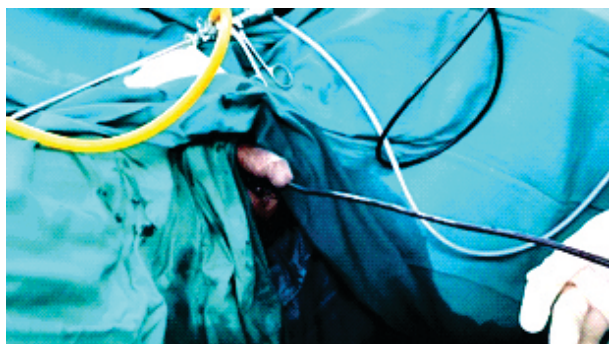
Figure 3. Foreign body withdrawn using grasping forceps