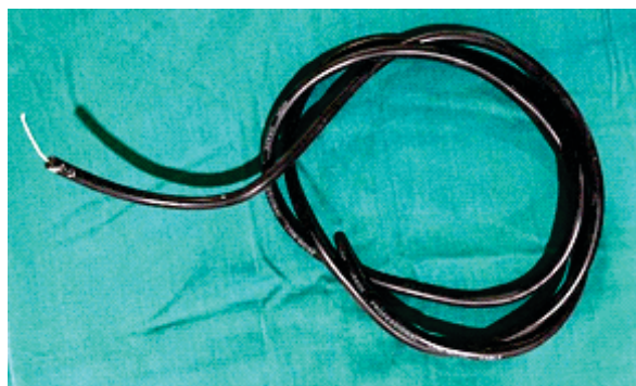
Figure 4. Electrical Wire.